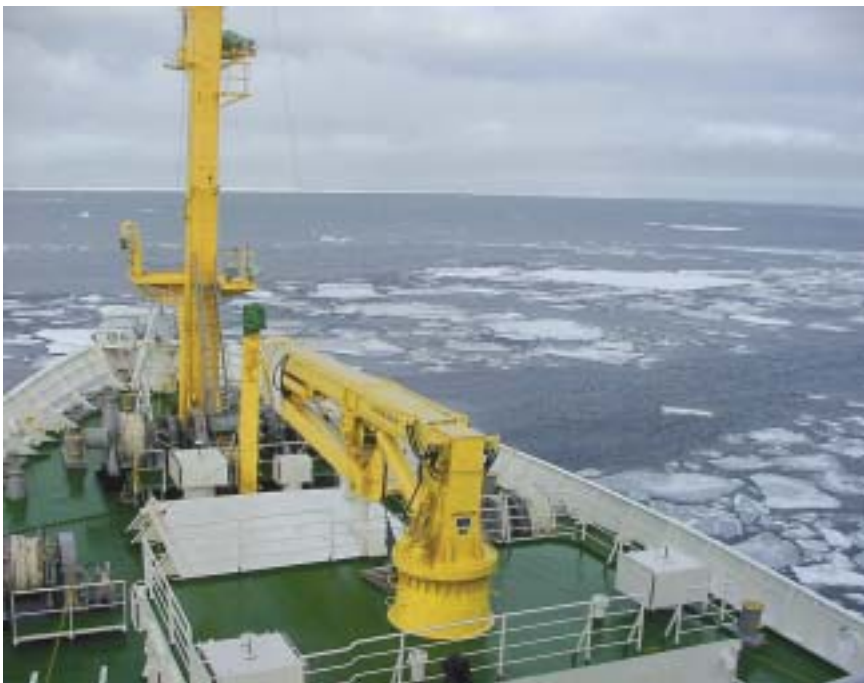
Vessel proceeds through open, new ice.